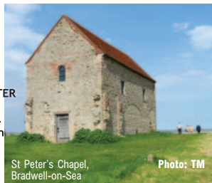
St Peter's Chapel, Bradwell-on-Sea